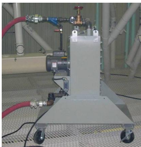
Figure 2 Portable steam heater (Armstrong International Inc.) used in heat treatment (Fields, 2007).