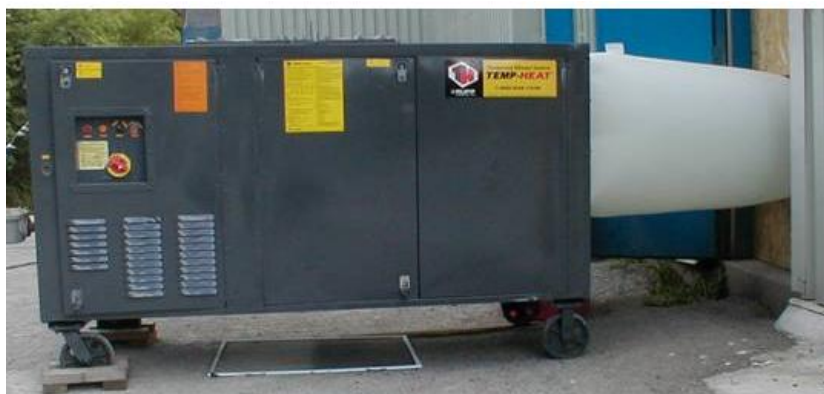
Figure 1 Propane-fired heater (Temp-Air) heater (source of heat for studies in Figure 3 and 4). The door was sealed with plywood, and a flexible fabric duct delivered heated air through a hole cut in the plywood,